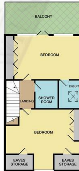
2ND FLOOR APPROX. FLOOR AREA 513 SQ.FT. (47.4 SQ.M.)

TOTAL APPROX. FLOOR AREA 2435 SQ.FT. (226.2 SQ.M.)