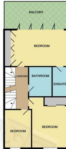
1ST FLOOR APPROX. FLOOR AREA 615 SQ.FT. (57.2 SQ.M.)